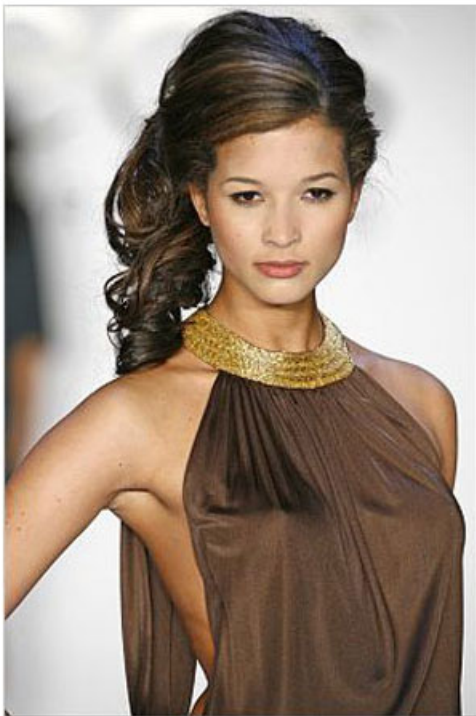
Gen Art Styles 2007

of the Ballroom, serenaded by the live bongo drum band as we sipped our beverages and checked out the swag bag which included gifts from the Body Shop, Ecrú, and an issue of New York Magazine. All in all, another fun evening hosted by our friends at Gen Art. --Vicki Salemi, NYC Correspondent